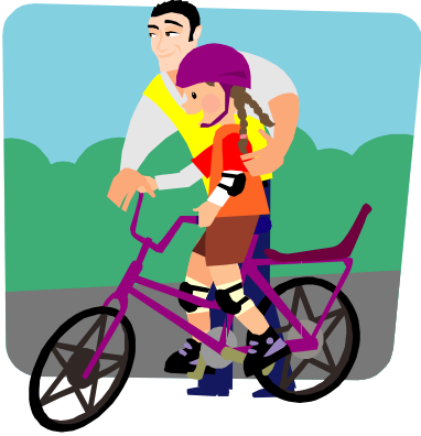
Ride your bike