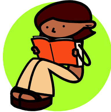
read a book or magazine