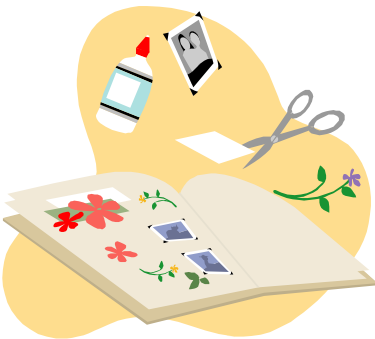
Make a craft