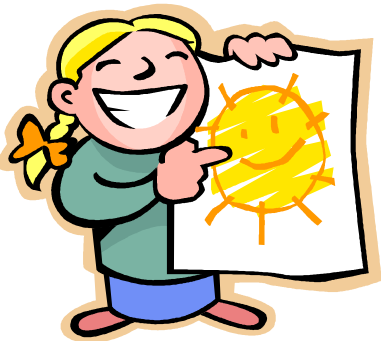
draw, paint, color, stamp