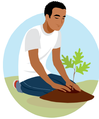
Dig, plant, water