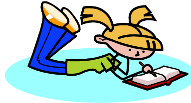
write a story, letter, or poem